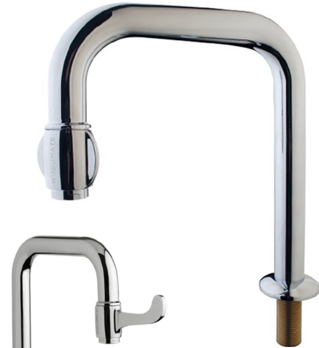
Pillar Tap Square with wrist blade option