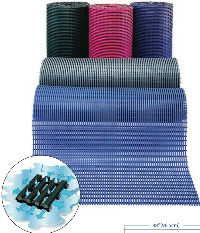
Instant 4 way drainage

CODE: WM-MAT-COM - to accompany the WuduMate Compact WM-MAT-CLAS - to accompany the WuduMate Classic