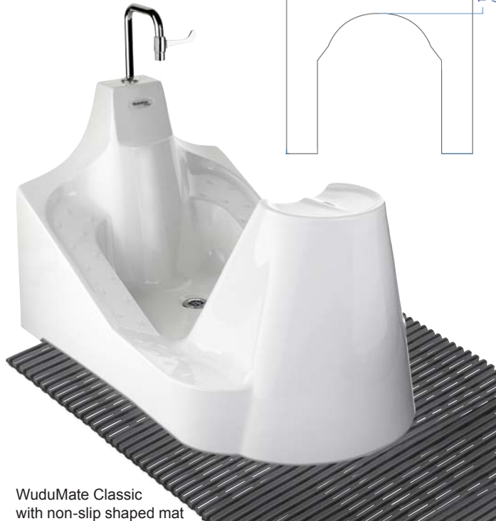
WuduMate Classic with non-slip shaped mat Weight of matting 2.85Kg