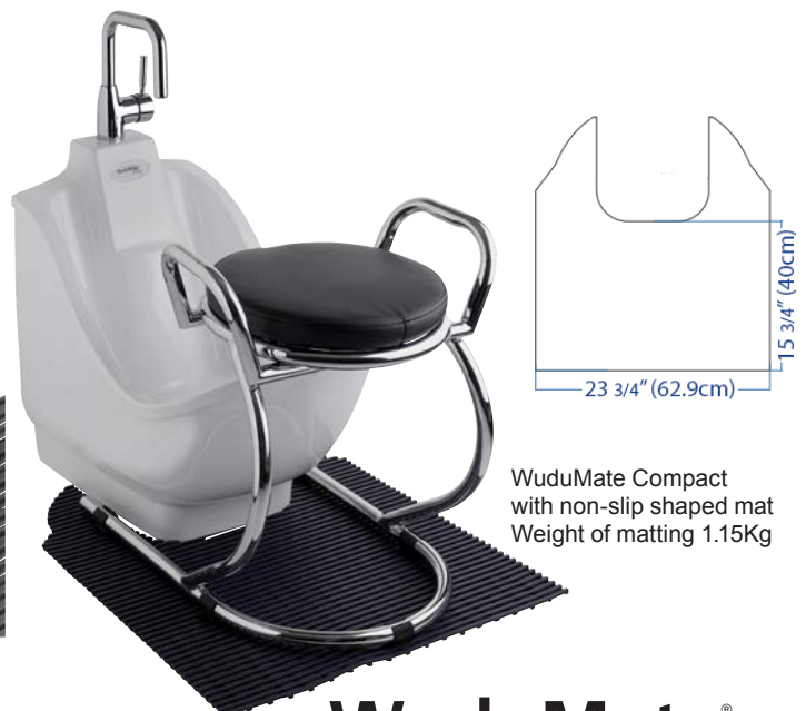
WuduMate Compact with non-slip shaped mat Weight of matting 1.15Kg