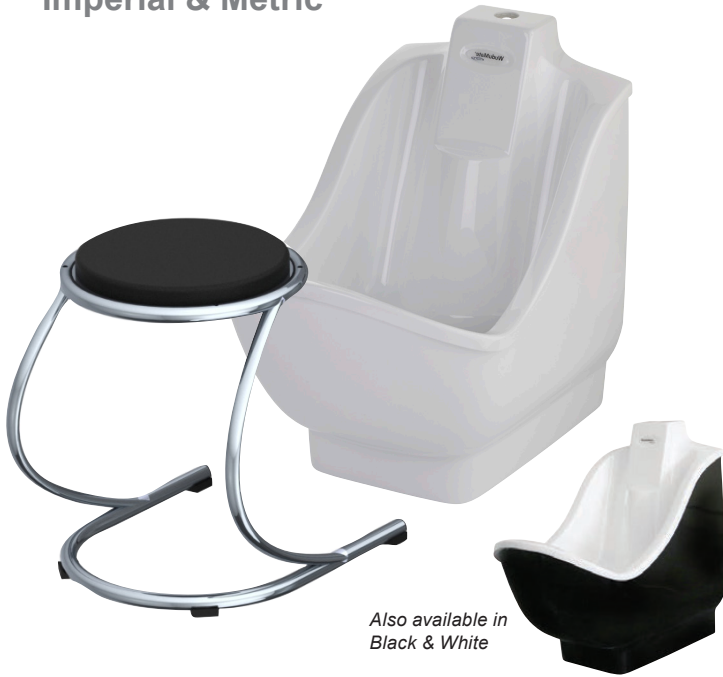
Also available in Black & White